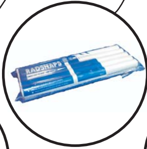
Product Code: V-RSW8