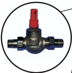
Product Code: VA-400405