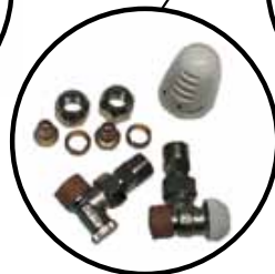
PRODUCT CODE: V-1773481P Shown here are PEX valves