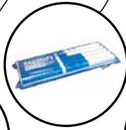
PRODUCT CODE: V-RSW8 To cover exposed pipe