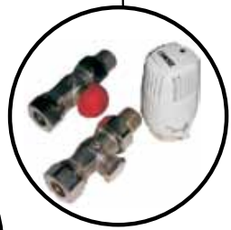
PRODUCT CODE: VA-ST1773367C Straight copper or chrome pipe valve set for towel warmer

The two pipe direct return pipe system is the most popular of piping systems using a common supply and return. As flow requirements decrease the pipe diameter can also be decreased. Using the lock shield valves provided it is possible to accurately balance the system to achieve an optimum flow rate. The modulating thermostatic valves will control each individual space for maximum comfort and efficiency. This information is intended as a guide only. Use competent qualified installers for pipe sizing and installation.