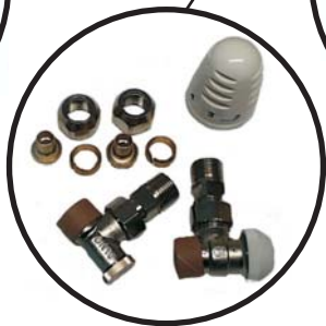
Product Code: V-1773484P