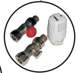
Product Code: VA-ST1773367C

STRAIGHT COPPER OR CHROME PIPE VALVE SET FOR TOWEL WARMER