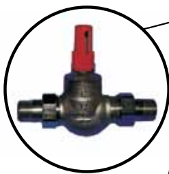
PRODUCT CODE: VA-400405 Automatic bypass