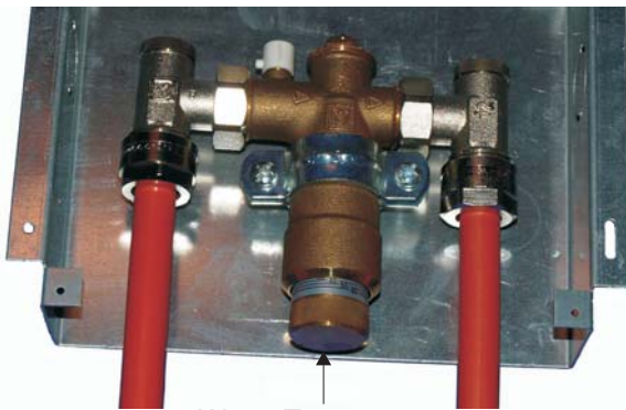
Water Temperature setting C.