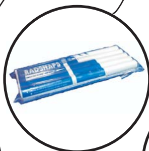
Product Code: V-RSW8