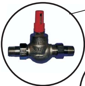
Product Code: VA-400405