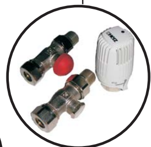
Product Code: VA-ST1773367C