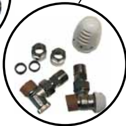
PRODUCT CODE: V-1773481C Optional copper valves