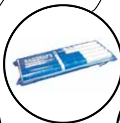
PRODUCT CODE: V-RSW8 To cover exposed pipe