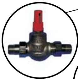
PRODUCT CODE: VA-400405 Automatic bypass