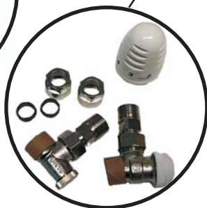
Product Code: V-1773484