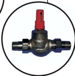
Product Code: VA-400405 AUTOMATIC BY-PASS