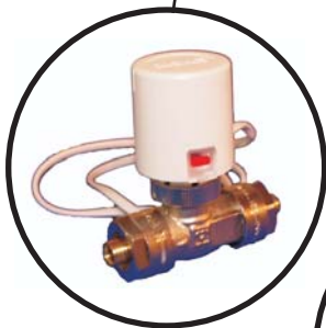
Product Code: VA-1771005P LOW VOLTAGE ZONE VALVE FOR PEX PIPE