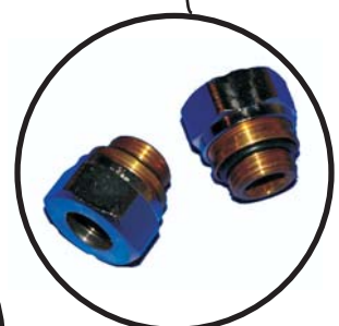
Product Code: VA-1300231P STRAIGHT CONNECTORS FOR CHROME TUBE

THE SERIES PIPING SYSTEM USING A LOW VOLTAGE ROOM THERMOSTAT TO CONTROL A ZONE VALVE OR MULTIPLE ZONES ONE OF THE FASTEST WAYS TO INSTALL A RADIATOR SYSTEM. CARE SHOULD BE TAKEN TO SIZE RADIATORS ACCORDING TO THE WATER TEMPERATURE DROP TO AVOID UNDER SIZING THE LAST FEW RADIATORS IN THE LOOP. THIS INFORMATION IS INTENDED AS A GUIDE ONLY. USE COMPETENT QUALIFIED INSTALLERS FOR PIPE SIZING AND INSTALLATION.