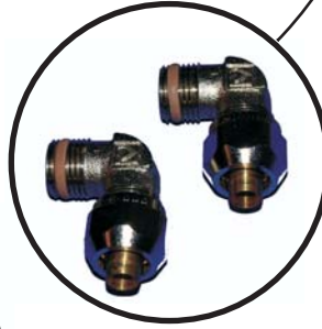
Product Code: VA-1624201P ANGLE CONNECTORS FOR PEX PIPE