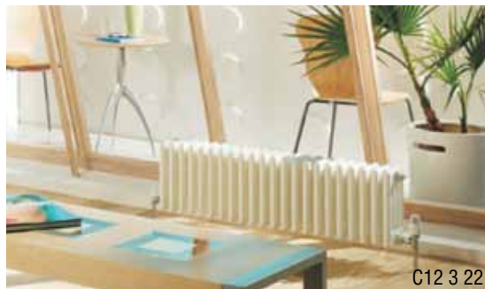
C12 3 22

All radiators can be custom painted to suit any décor. Once painted are non returnable.